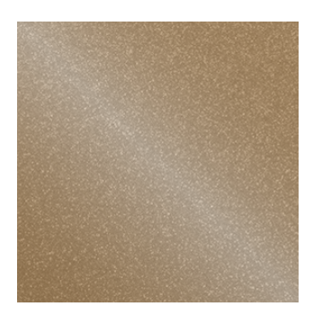
Gold Nugget FRSL 95571 SRSS 90464