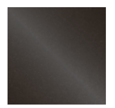
Warm Bronze FRML 90494 SRML 90499