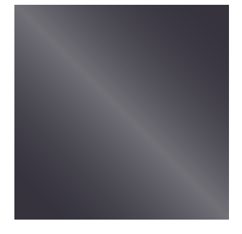
Cosmic Gray FRSL 96598 SRSL 95568