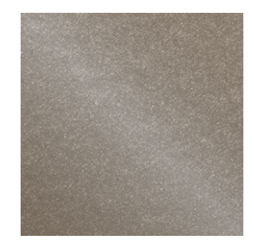
Light Bronze FRSL 96599 SRSL 95569