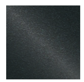
Fine Texture Black Chrome FRML 90501 SRML 90503