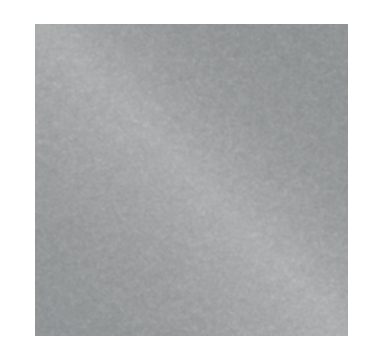
Sunlit Silver FRML 90484 SRML 90487