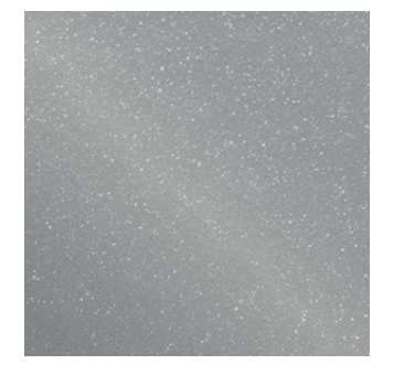
Classic Platinum FRSL 96595 SRSS 95565