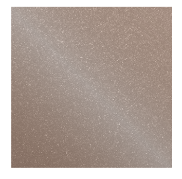
Champagne FRSL 96596 SRSL 95566