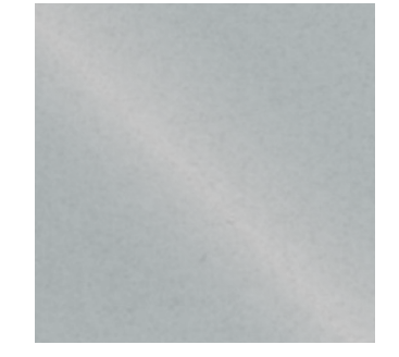
Timeless Silver FRML 90492 SRML 90493