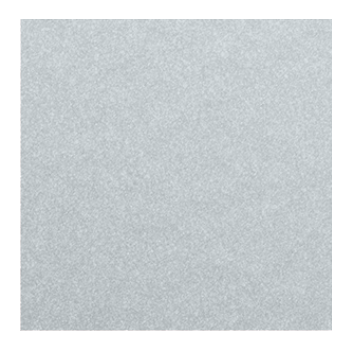
Anodized Silver FRSL 94542 SRMS 95339