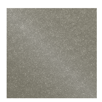
Medium Bronze FRSL 95579 SRSL 95576