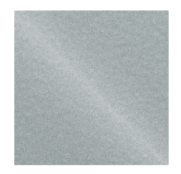
Matte Platinum FRML 95458 SRSM 95573