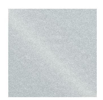
Silver Sparkle FRSS 93652 SRSL 95572