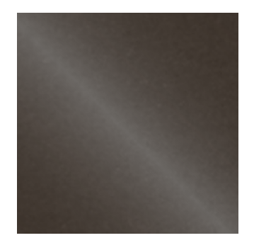
Industrial Bronze FRML 90480 SRML 90482