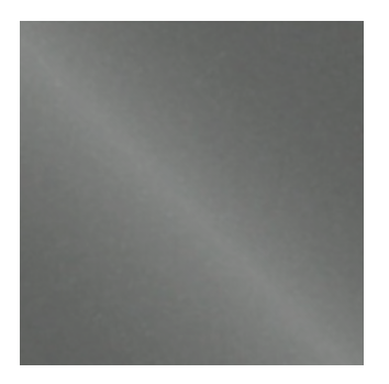
Stormy Silver FRML 90488 SRML 90489