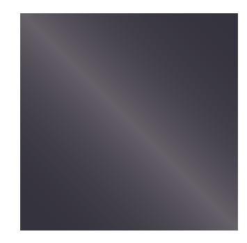
Cosmic Gray SRSL 95568 FRSL 96598