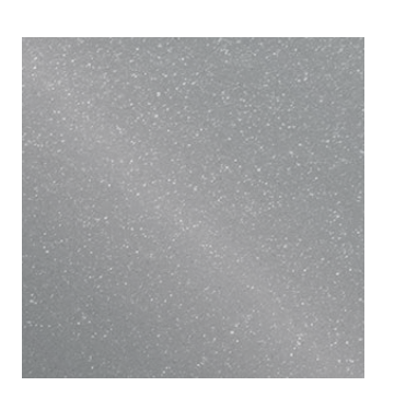
Classic Platinum SRSS 95565 FRSL 96595