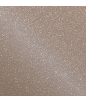
Champagne SRSL 95566 FRSL 96596