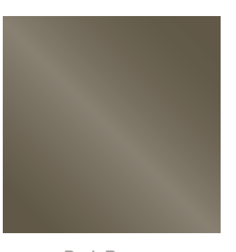
Dark Bronze SRSL 95575 FRSL 95578