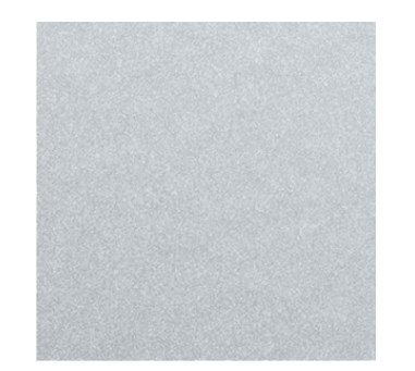
Anodized Silver SRMS 95339 FRSL 94542